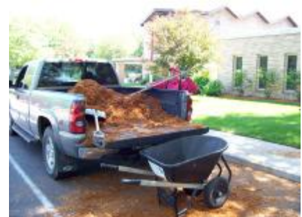
Bill Kolpanen unloading mulch for the flower beds.