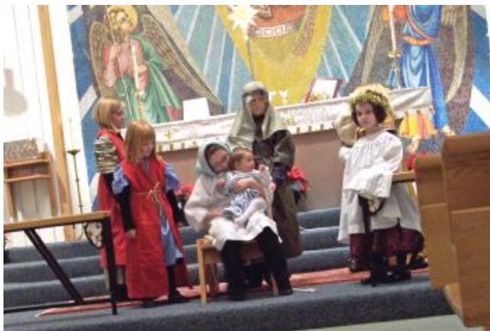
Children's Christmas Pageant